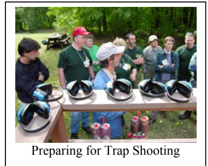
Preparing for Trap Shooting