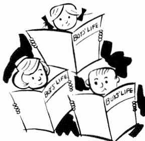
IT'S A FAMILY AFFAIR

Look at next month for our 1983-84 district calendar. Prior planning makes for a successful year.